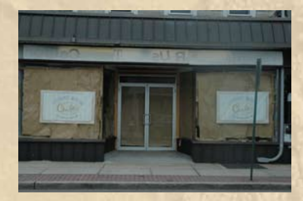
New Stores on Main Street