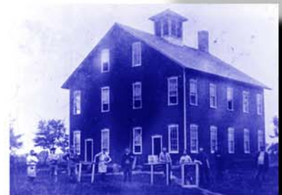
BAUSCH PICTURE FRAME CO., ca 1880 Original building on corner of Rose and Richard Streets.