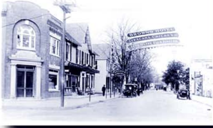
MAIN STREET, Brown's Hotel on left Northwest corner of Main and Conklin Streets, looking north. Bank of Farmingdale on corner.