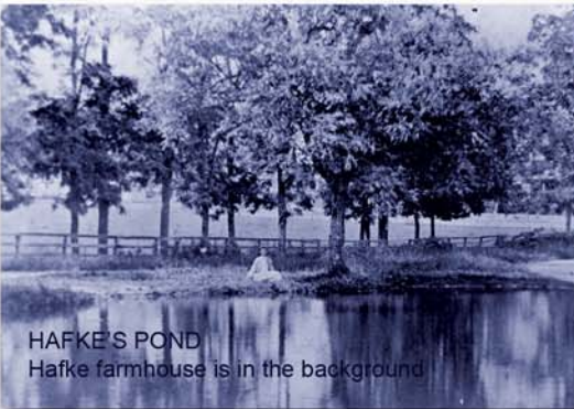
HAFKE'S POND Hafke farmhouse is in the background