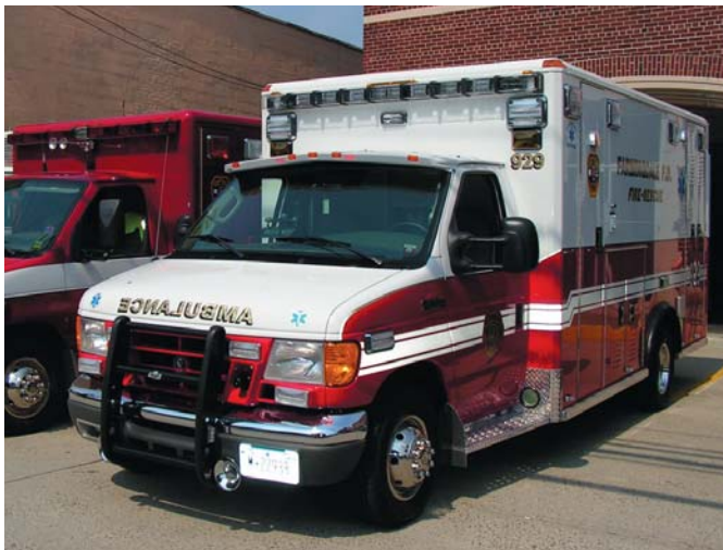
The Village Board and the Farmingdale Fire Department are pleased to announce that the recently purchased ambulance equipped with the latest life saving tools is now in service.